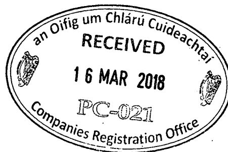
Niamh Dermody Registrar High Court